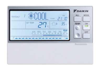
MODEL NO: DCS303A51